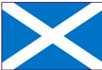
St Andrew's Cross