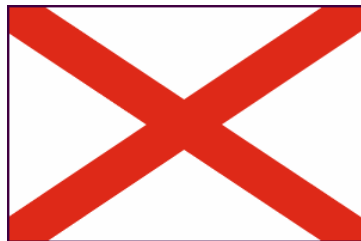
St Patrick's Cross

Four years after the Act of Union with Ireland in January 1801, when the red diagonal cross of St Patrick was added, Lord Nelson ordered the Union Jack to be flown by the British fleet at Trafalgar as a battle flag. It has been flown on all British ships of war and naval bases ever since.